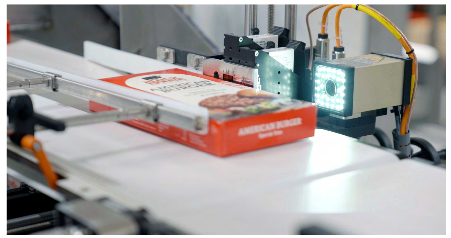
Printer and camera work together